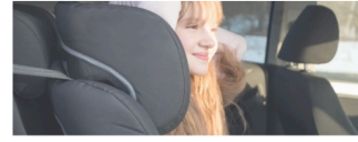
20 Questions for the Car