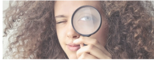
Learning Through Intrigue